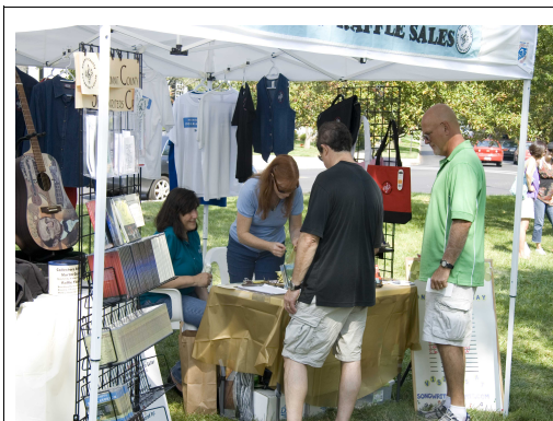
Concessions are just one way we raise money to fund future projects. Clubs dues are essential for the future!

Right now these are just ideas and will need a lot of effort from members to be realized. Please lend a hand to make this club even more for even more!