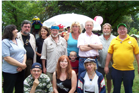
This is as close as we have to a portrait of all the club officers and volunteers. With the recent addition of a club photographer the shots should be getting better than this phone camera picture!